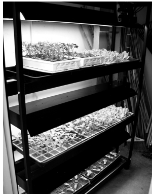
Light box bought with donation from the NWHS 2008 Christmas raffle money.

The August outing to the YWCA roof top garden was humbling and inspirational to see what can be grown in six inches of soil, five stories up. Ted Cathcart, who initiated the garden, and Juliana Pasko, who provides Master Gardener guidance, were our tour guides for the garden.