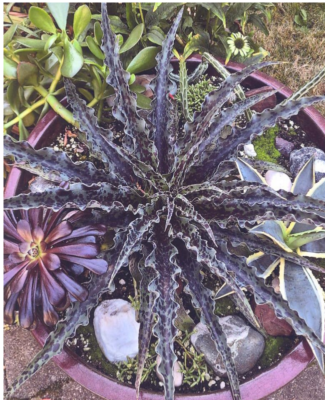
2022 First Place: Container, Terri Clark-Kveton